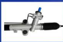
Power Steering Rack